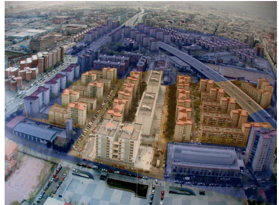
Panoramic view of Sant Roc